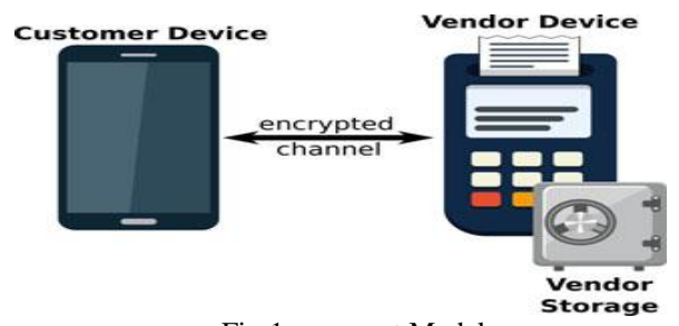
Fig 1. payment Model

Using offline model we create an encrypted channel between customer device and vendor device. Here the authentication of vendor is done by utility function, and a common agreement should be between vendor and user. Coin element is generated randomly instead of real cash. Here utility function is master of offline model model.